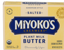
Miyoko's Organic Cultured Vegan Butter

Built on the foundation of craft and compassion, Miyoko's Creamery is the natural, compassionate evolution of dairy—using time-honored techniques and the finest ingredients to make our award-winning, phenomenally vegan, plant-milk butter and cheese.