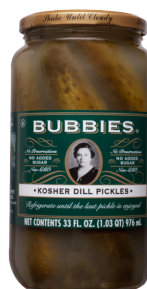
Bubbies Kosher Dill Pickles