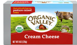
Organic Valley Organic Cream Cheese