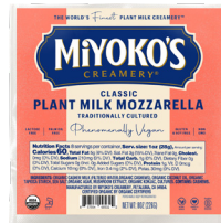
Miyoko's Organic Vegan Mozzarella