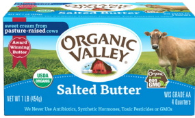
Organic Valley Organic Butter